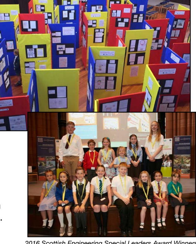
2016 Scottish Engineering Special Leaders Award Winners

...as well as telling us a few things about themselves and the engineers they interviewed, with all of the information included within the framework of a standard letter format.