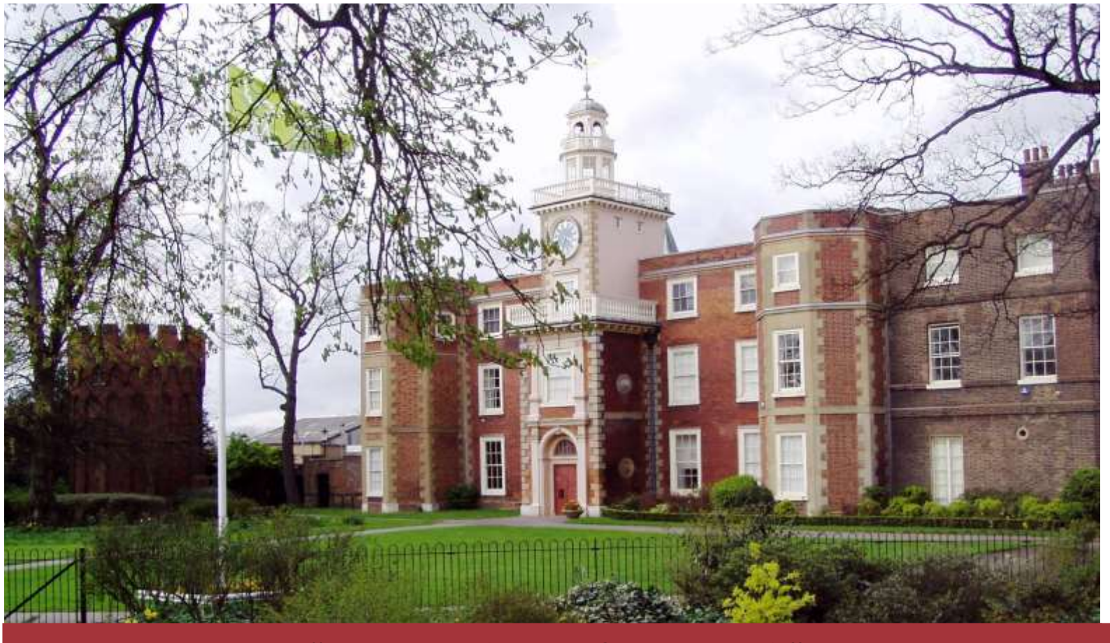
"Bruce Castle do a fantastic job"