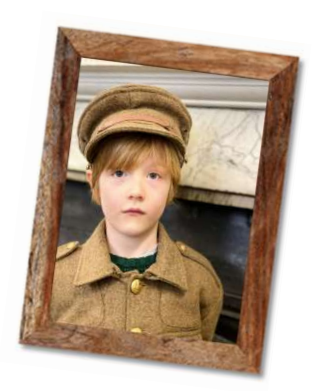
"Thank you for such a brilliant experience"

Links to: History: A study of an aspect or theme in British history that extends pupils' chronological knowledge beyond 1066; a significant turning point in British history